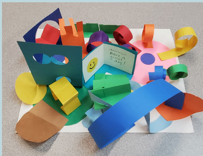
3-D Paper Art with Miss Chrissy Wednesdays were for our creative Kindergarteners, 1 st graders and 2 nd graders!